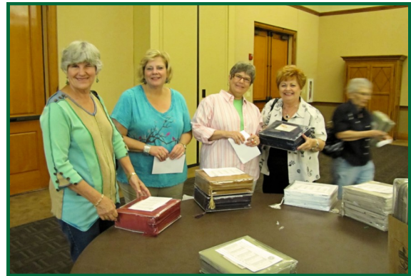
“Did you ask about getting me a bigger room?”

© LaughingStock International Inc./dist. by UFS Inc., 2009